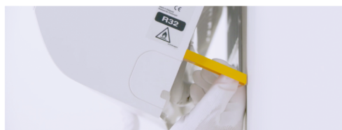
Built-in support holders