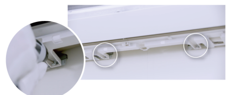
Screw holders for uneven surfaces