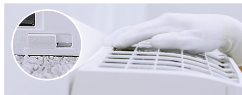
User-friendly slider locks